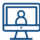
Market Update Calls