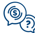
Commentary & Resources