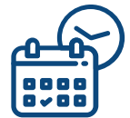
Advanced Wealth Planning*