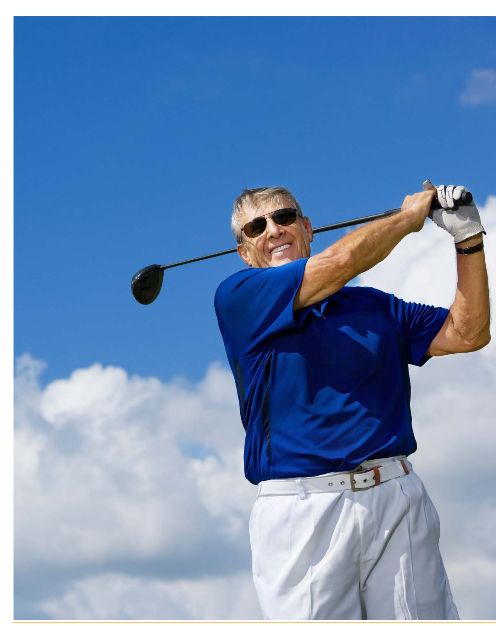
Page 10 | Where Do We Go from Here?