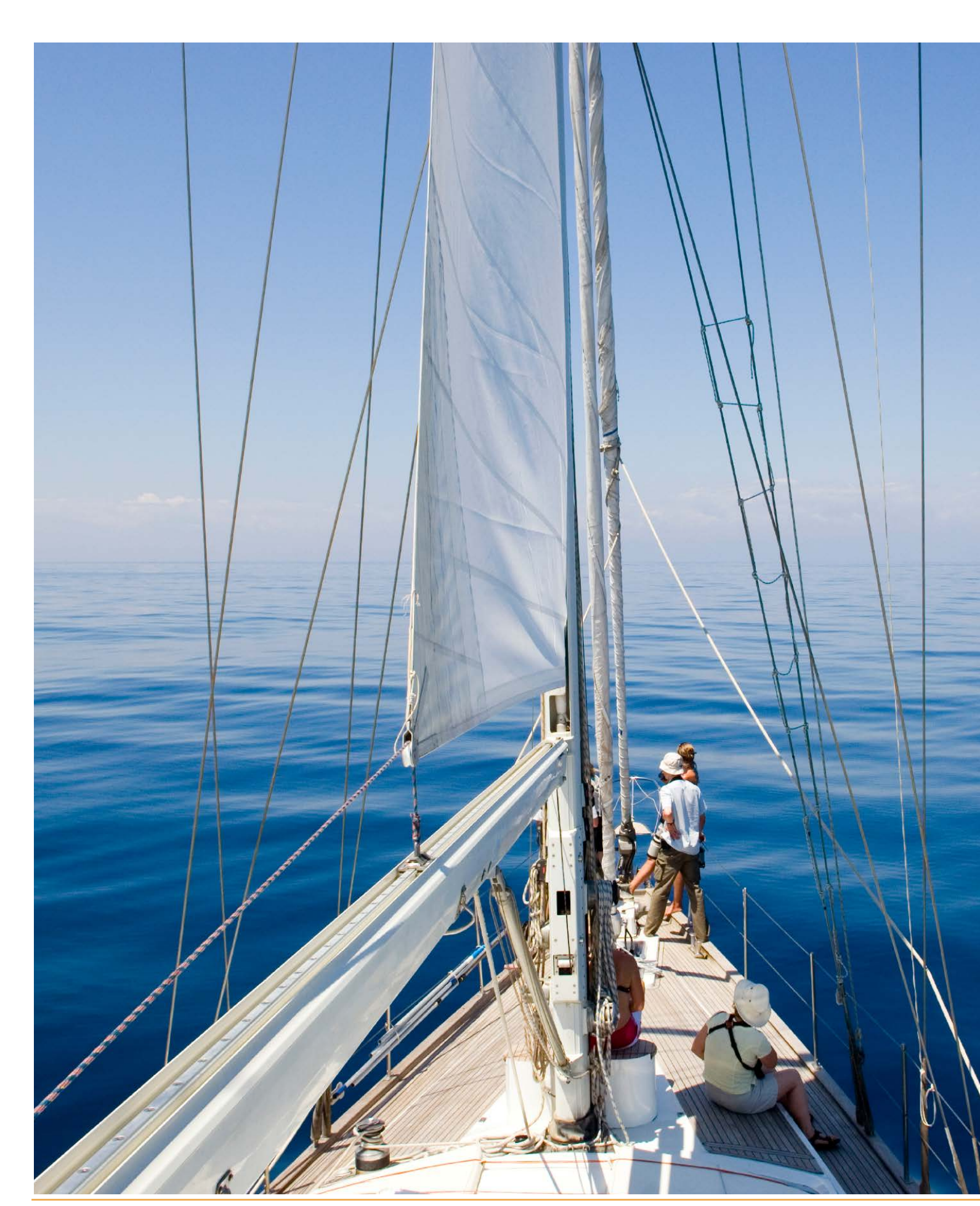
Page 14 | Where Do We Go from Here?