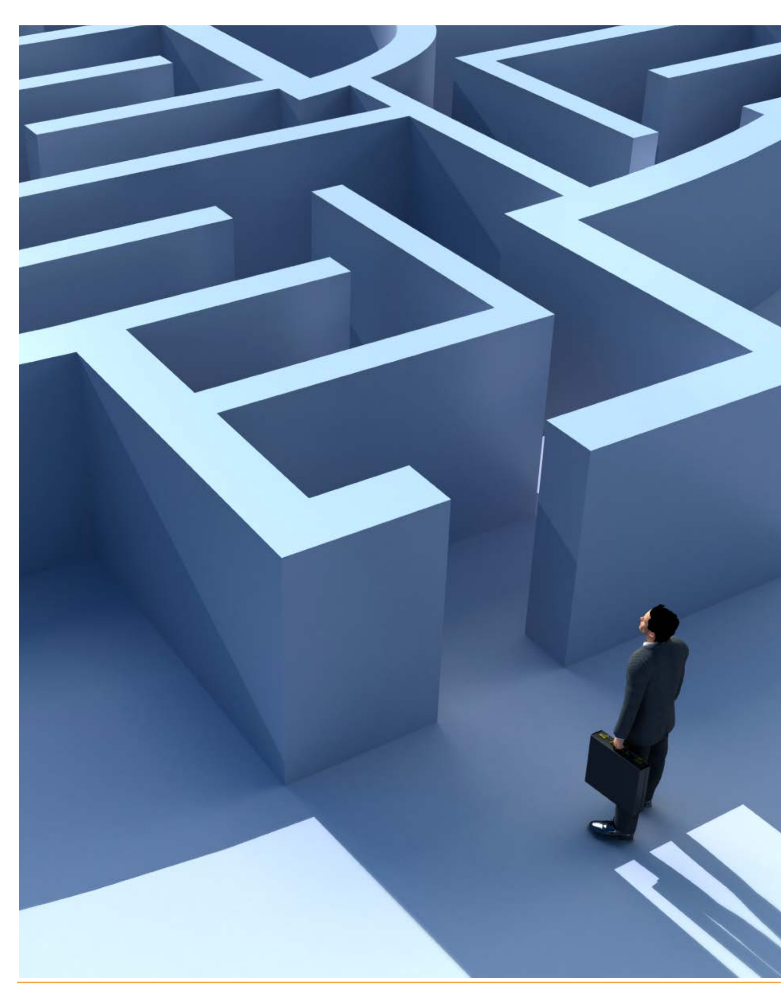
Page 8 | Where Do We Go from Here?