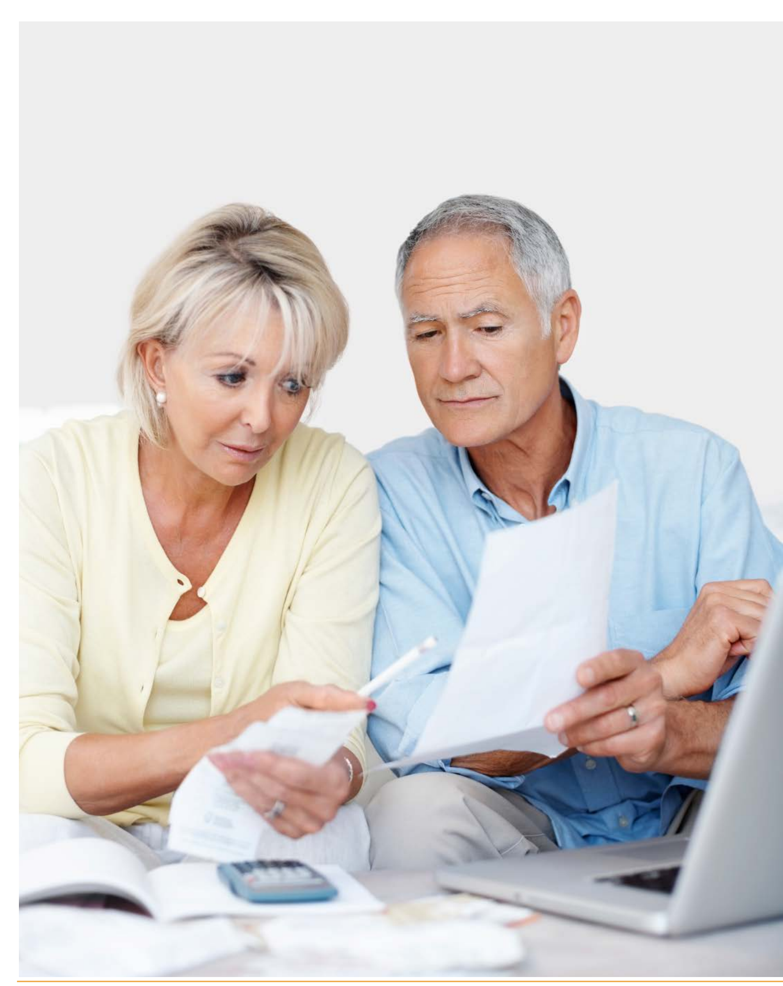
Page 2 | Where Do We Go from Here?